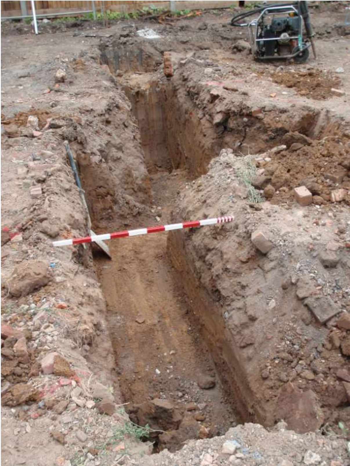
Plate 9. Excavation of foundations looking east (November 2015)