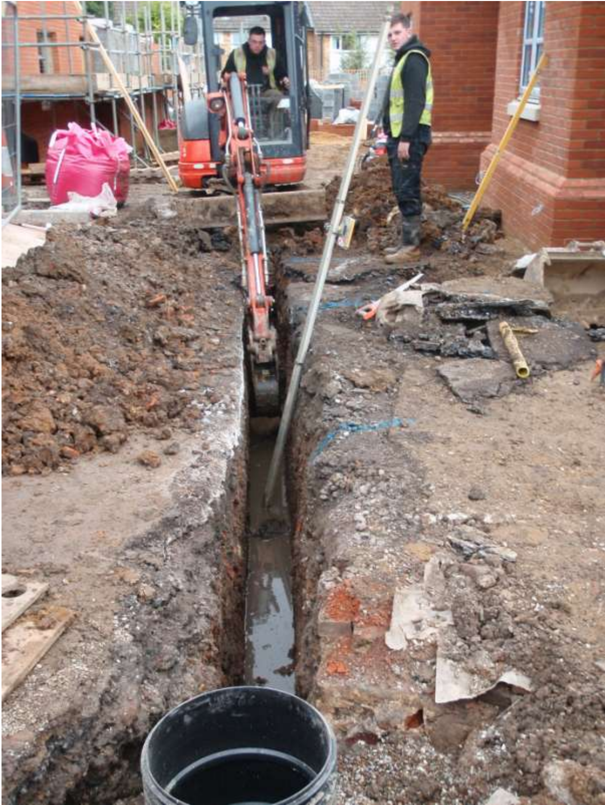
Plate 10. Excavation of utility trenches looking north (February 2016)