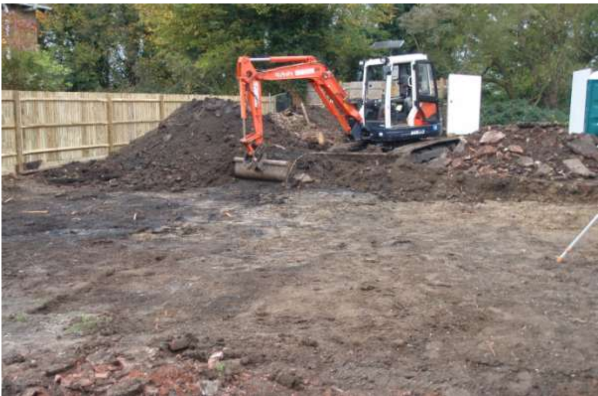
Plate 3. General view of site strip looking north (August 2015)