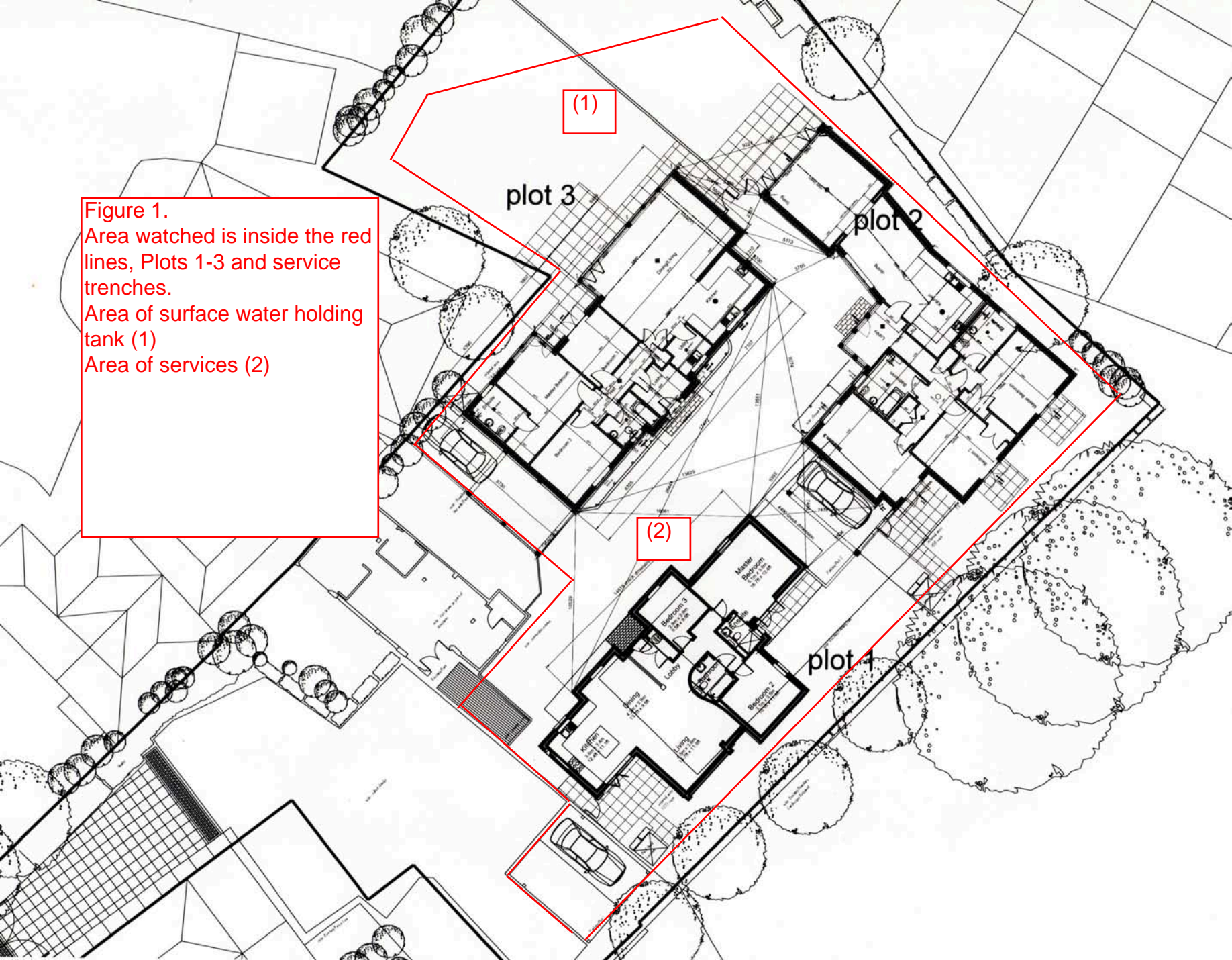
Figure 1. Area watched is inside the red lines, Plots 1-3 and service trenches. Area of surface water holding tank (1) Area of services (2)