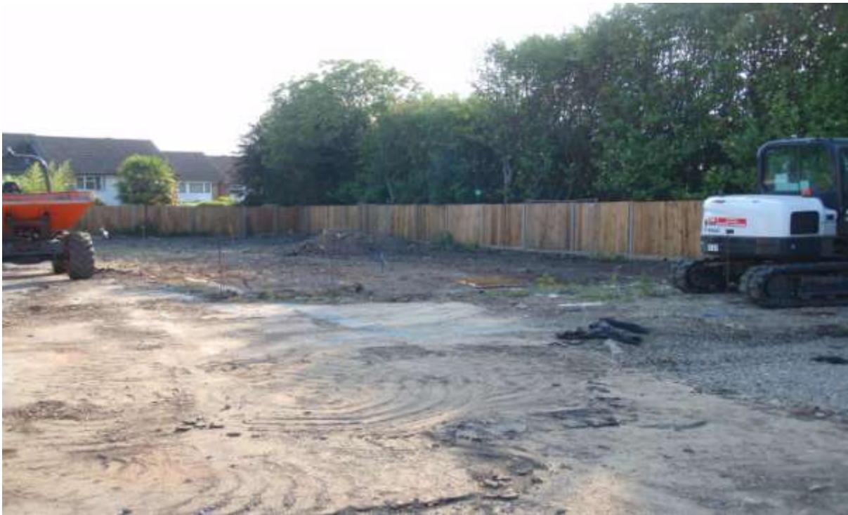
Plate 2. General view of site looking north-east (August 2015)