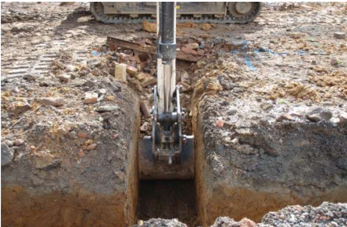
Plate 5. Excavation of foundations, note made up ground above natural (August 2015)