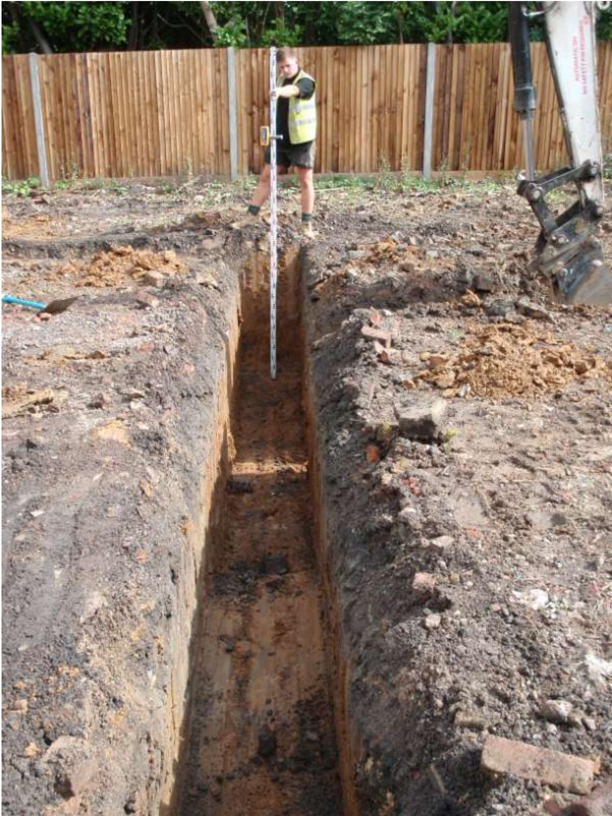
Plate 8. Excavation of foundations looking north (October 2015)