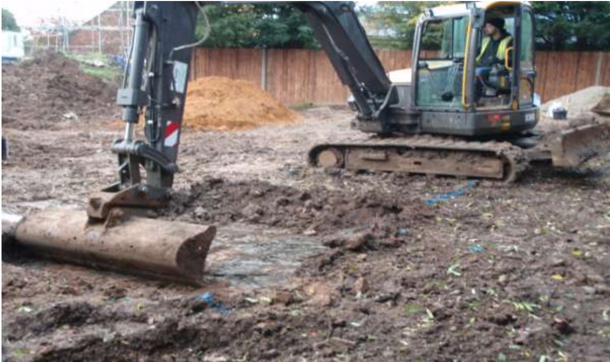
Plate 6. Excavation of surface water holding tank looking north (September 2015)