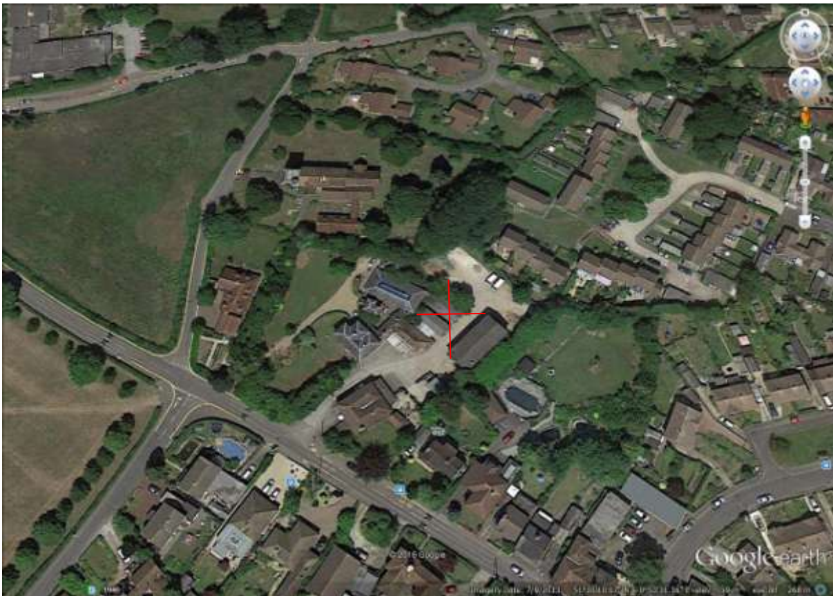
Plate 1. Aerial view of site (red target) showing the site prior to development.

(Google Earth 9/07/2013: Eye altitude 268m).