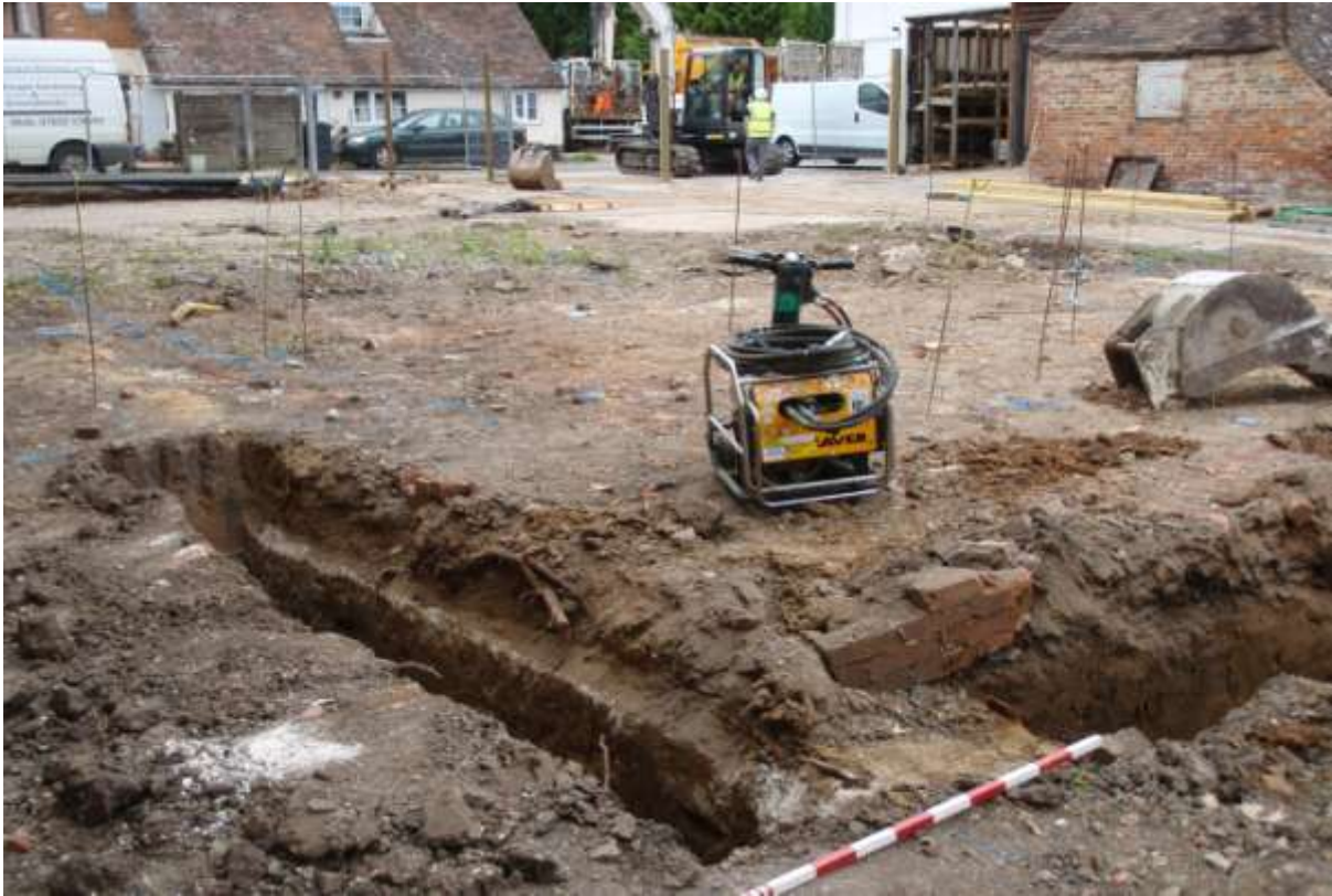
Plate 4. Excavation of foundations looking south, note disturbed modern foundations (August 2015)