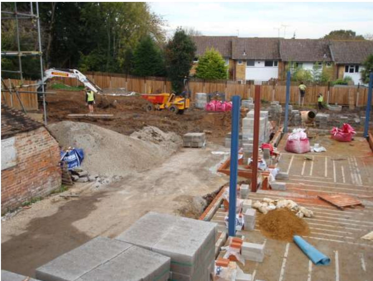
Plate 7. View of site(September 2015)